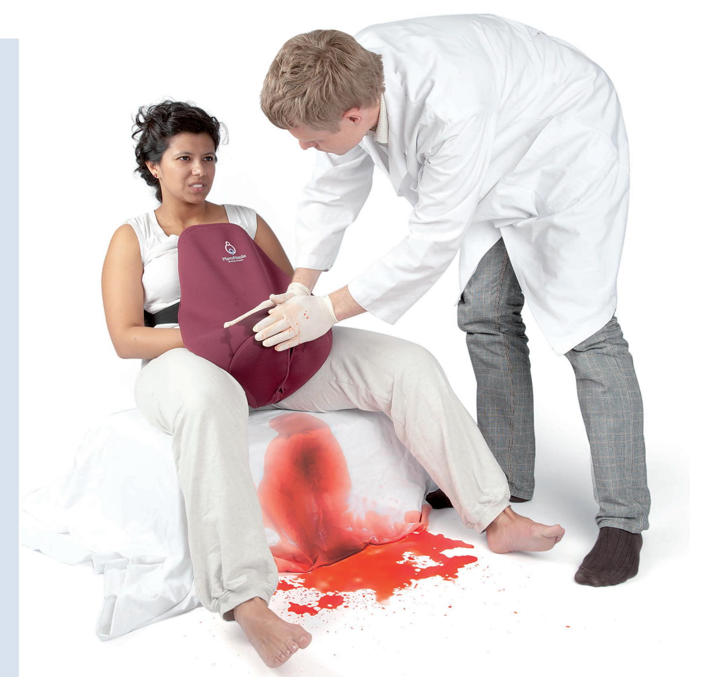
Use inside low-cost birthing simulator for complete birth and postpartum simulation training

The field test is expected to be completed 2014.