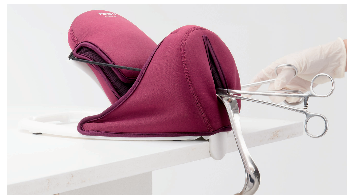
Change uterine angle by applying pressure to the model.