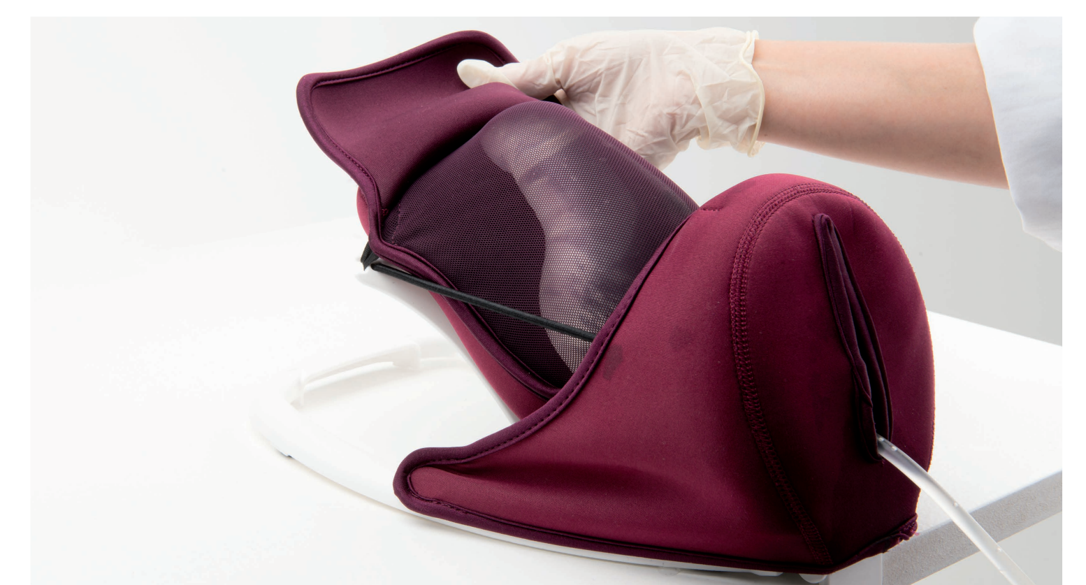
Practice "blinded" placements and lift cover of the uterus to evaluate placement.