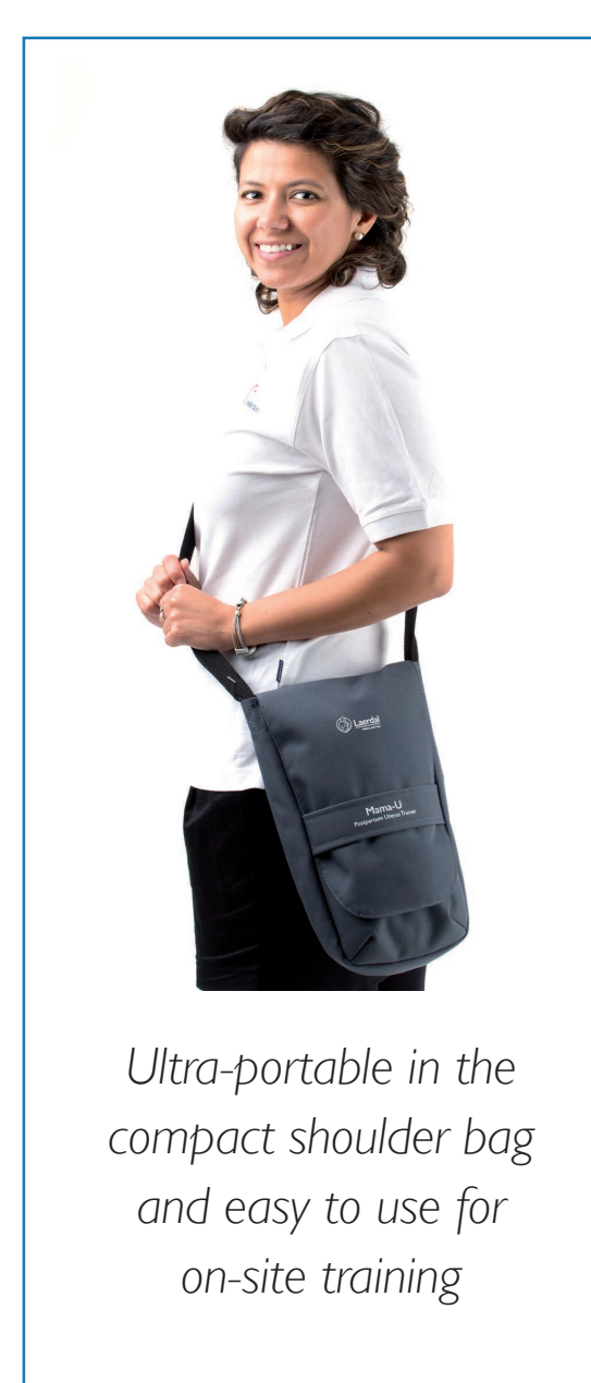
Ultra-portable in the compact shoulder bag and easy to use for on-site training