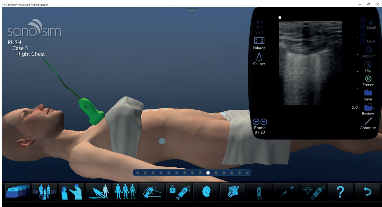
Multiple groupings of B-lines suggestive of increased fluid content