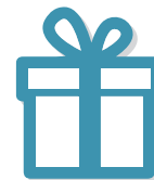
Figure out what's in it for them

Look for a correlation between their why and yours.